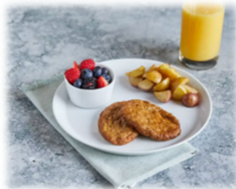
Chicken Sausage Patties