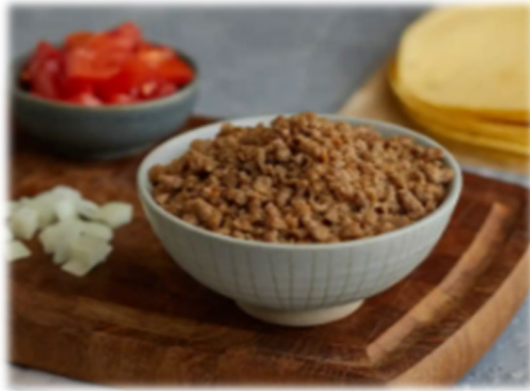
Hillshire Farms Beef Crumbles 2.4 oz