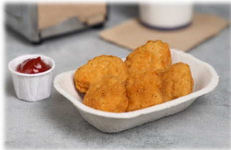
Homestyle Chicken Nugget