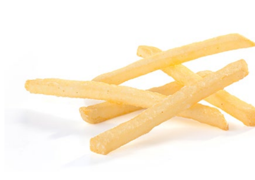
Fine Coat Shoestring