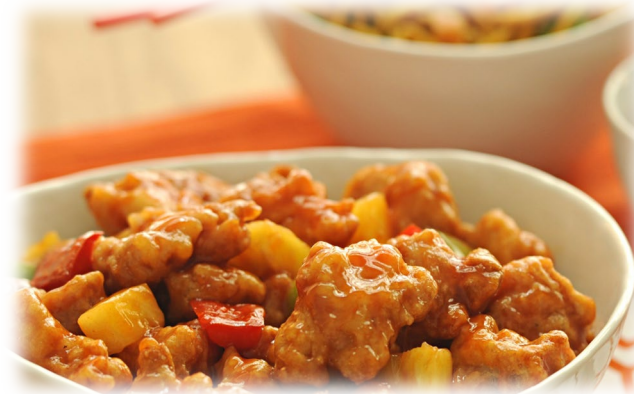
Sweet and Sour Chicken