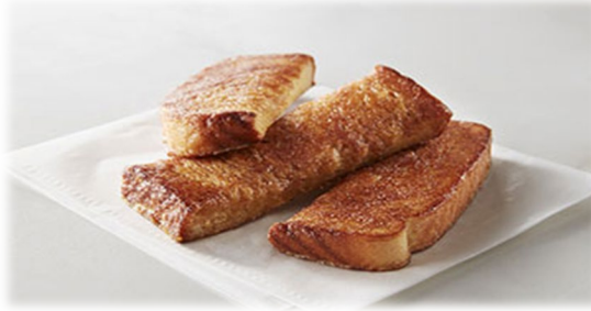
WG French Toast Sticks