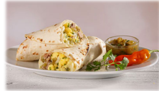
Precooked Scrambled Eggs