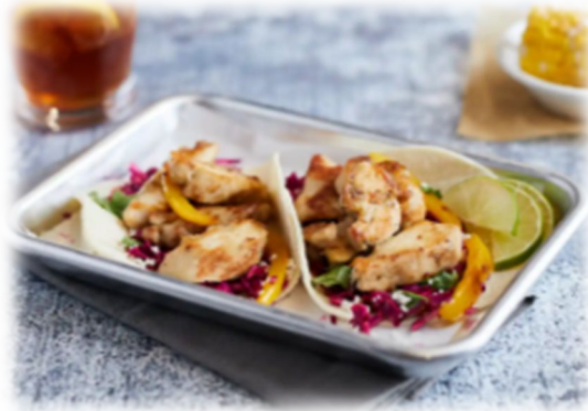
Chicken Fajita Strips