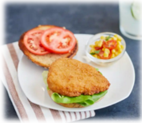
Crispy Chicken Patty