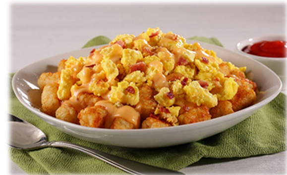
Bacon and Cheese Eggstravaganza