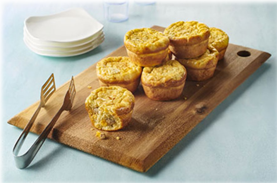
Egg Bites w/Turkey Sausage & Cheese