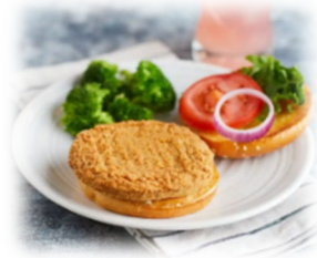
Chicken Crispy Patty