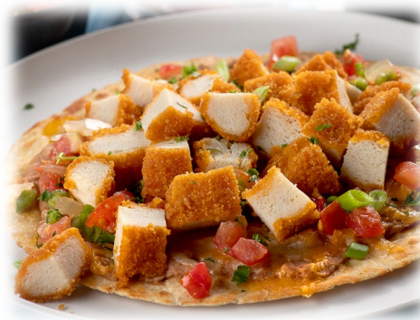
Hot & Spicy Chicken Patty