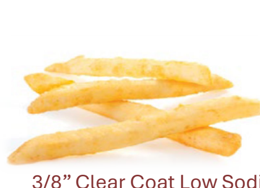
3/8" Clear Coat Low Sodium