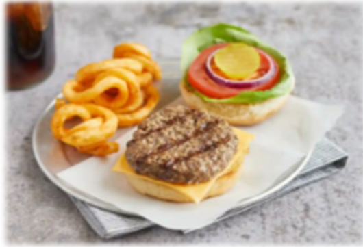
Flame broiled 2.30 oz Beef Patty