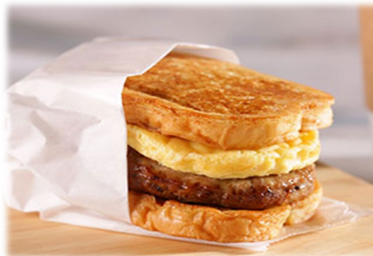
Grilled Egg Patty