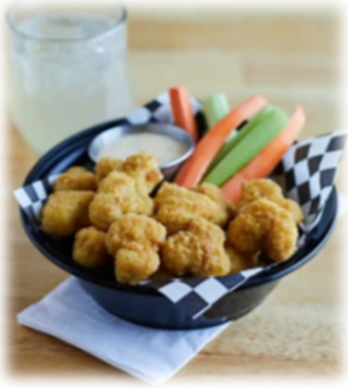
Chicken Breast Chunks