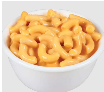
Mac & Cheese