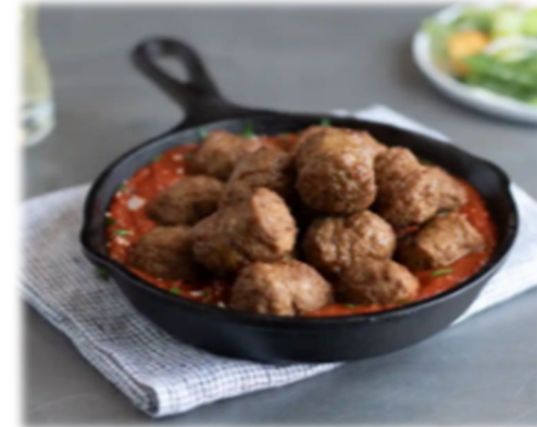
AdvancePierre Deluxe Meatballs .5 oz.