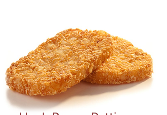
Hash Brown Patties