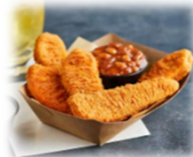
Hot & Spicy Chicken Strip