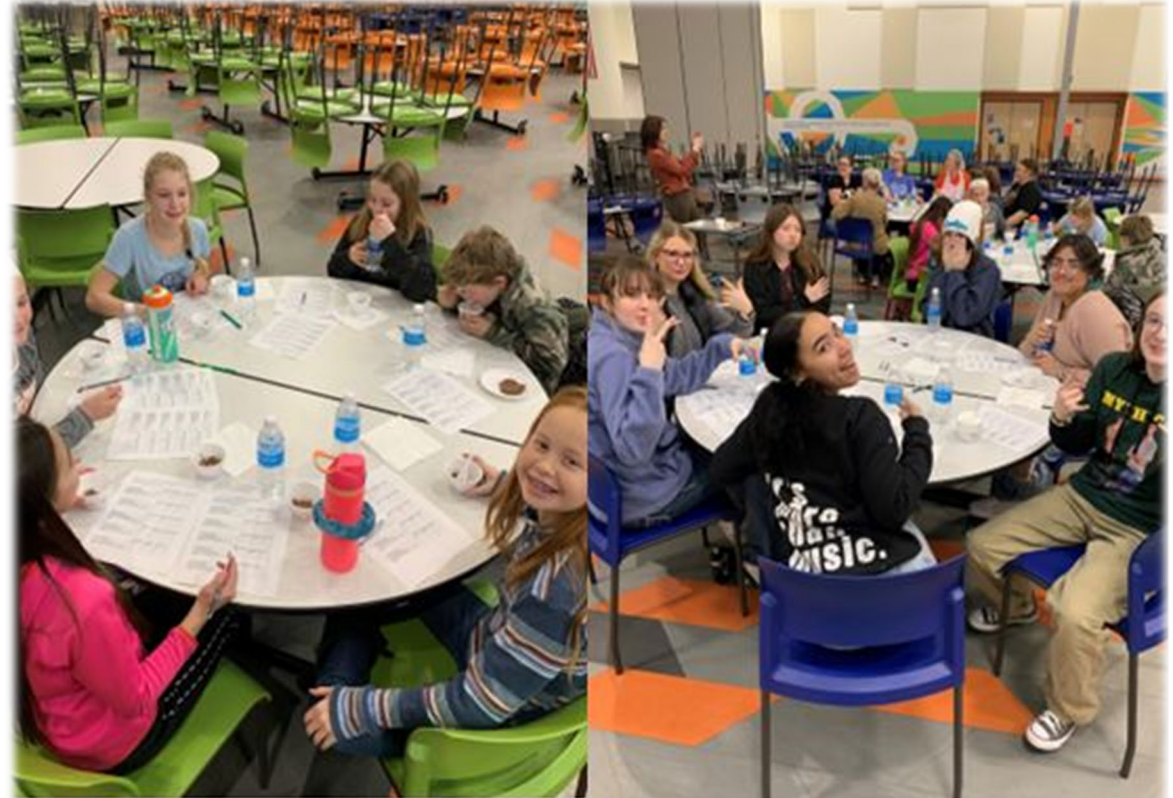
Dickinson Public School Taste Testing Beef