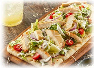
Chicken Fajita Strips