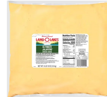
Cheese Sauce Pouches: