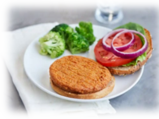
Hot & Spicy Chicken Patty