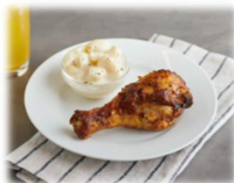
Mesquite Glazed Drumstick