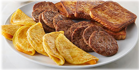
Colby Cheese Omelet