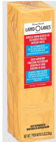
Sliced American Cheese