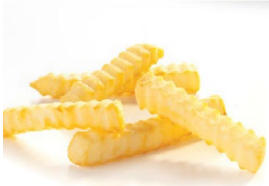
1/2" Crinkle Cut