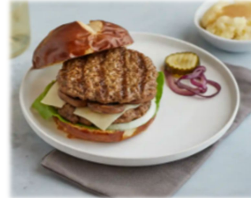
Flame Grilled 3 oz Beef Patty