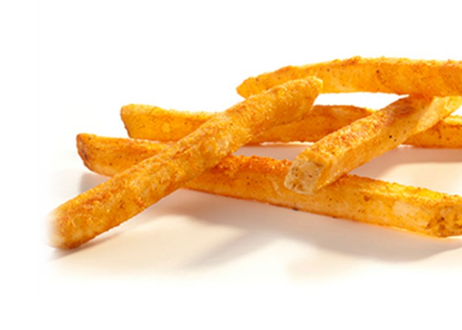
Spicy Straight Cut