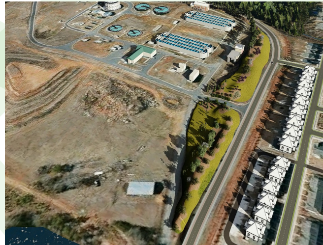
Rendering of the Twelve-Mile Creek WWTP Expansion