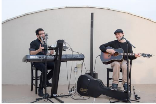
Castle Wild - featured performers at the SOFE House Concert