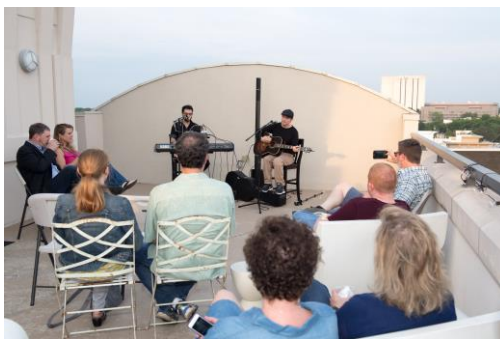
Up-close and personal with Castle Wild

Matilda at Raleigh Memorial Auditorium, May 27, 2:00pm