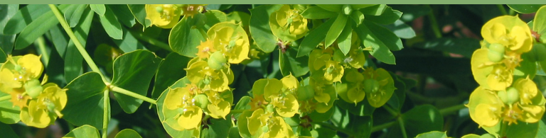
leafy spurge