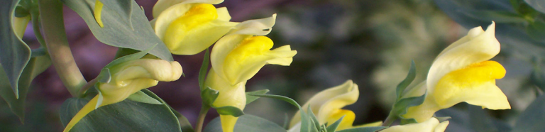
Dalmatian toadflax