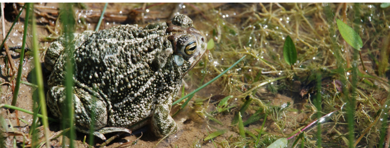
Great Plains toad

Carefully avoid contamination of water by terrestrial herbicides to protect aquatic life.