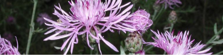
spotted knapweed

sublethal effects may not be reported. Some inert chemicals may exert biological activity and toxicity. Most glyphosate-based herbicides (Roundup and many others) contain the surfactant POEA, which is more toxic to aquatic life than glyphosate alone. Extensive studies document sublethal effects to fish and amphibians on endocrine and immune function, suspected of contributing to population declines. The aquatic glyphosate formulation Rodeo omits POEA.