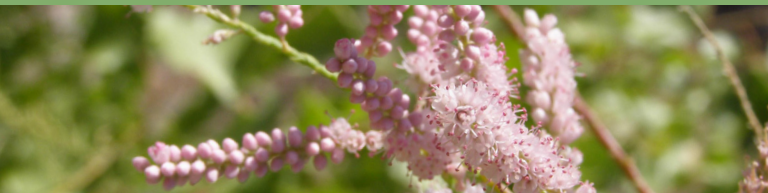
saltcedar

This brochure presents an overview of commonly asked questions posed by the public. Questions focus on the use of herbicides to control noxious weeds on non-crop sites, such as rangelands and pastures, forests and roadway rights-of-way, and the potential risks that may be associated with their use. Herbicide risk is not always a straightforward issue to which simple 'yes' or 'no' outcomes are provided. The answers given in this brochure are not exhaustive but are intended as an overview.