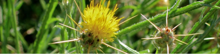
yellow starthistle - Chris Bersbach