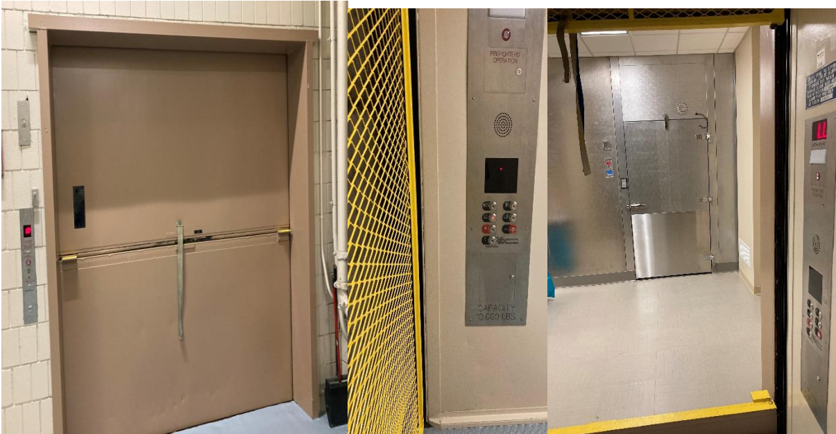
Pictures of the service elevator inside sally port. LL is secure, Decedent Affairs Coordinator or Security will assist with getting elevator to LL. Morgue view from elevator.