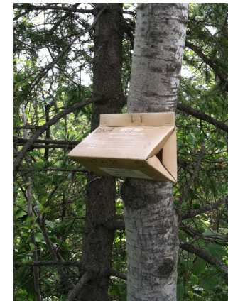
Lymantria dispar Detection Trap