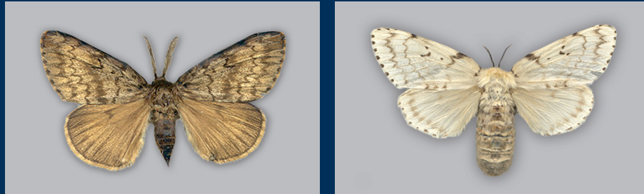
Gypsy moth ( Lymantria dispar ): male left, female right

Deadline for Applications: March 1, 2022