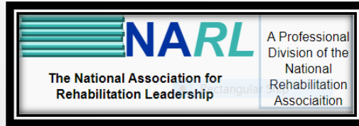
NATIONAL ASSOCIATION FOR REHABILITATION LEADERSHIP (NARL)