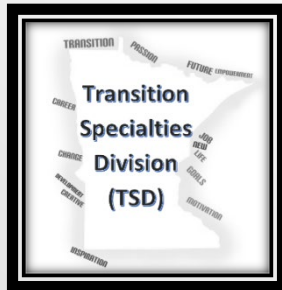
MRA TRANSITION SPECIALTIES DIVISION