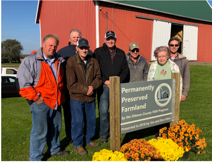
Three generations of the Klein family pose around their preserved property

The County's anchor program for supporting agriculture is its Farmland Preservation Program. This program protects our vital farmland by placing permanent conservation easements