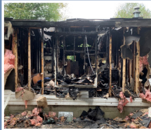
Exterior of the Stille residence after the blaze on October 1.