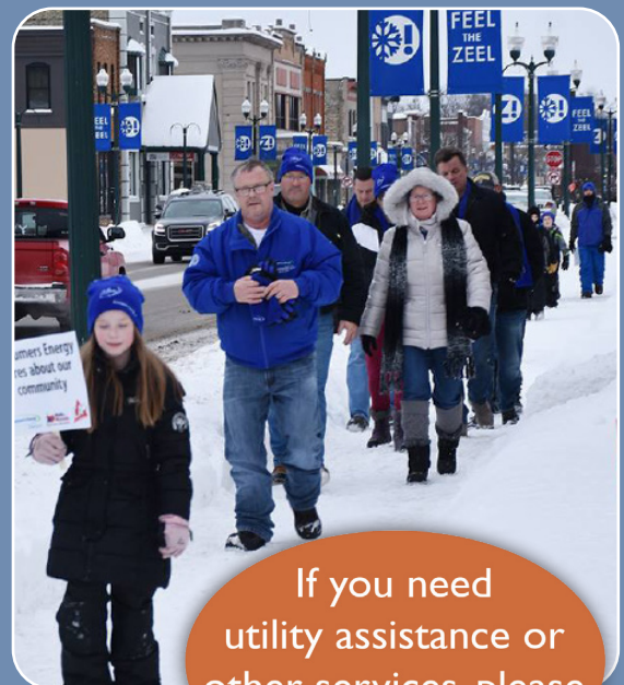
A group participates in Walk for Warmth in 2019

If you need utility assistance or other services, please call 211.