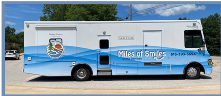
Miles of Smiles welcomed a new mobile unit in the fall of 2020. The unit administers nearly all of the oral health services you would receive at an annual visit to a traditional dental office.

For more information on Miles of Smiles or to learn how you can volunteer, visit www.miOttwa.org/dental or call 616-393-5694.