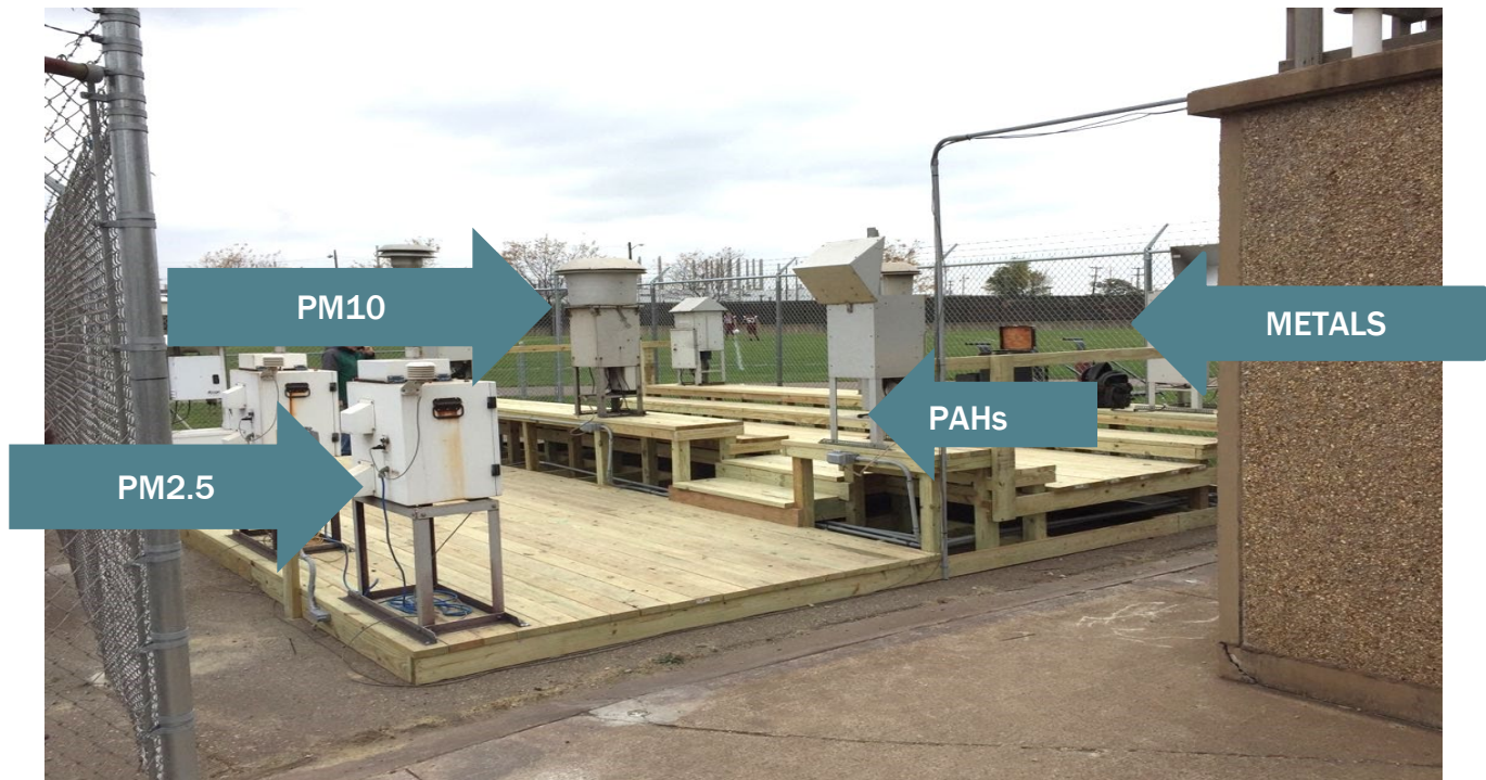
Figure 1: The Dearborn air monitoring station at Salina Elementary School is featured below.

Since the early 1970's, the Michigan Department of Environment, Great Lakes and Energy has taken air pollution measurements of the outdoor or "ambient" air around the state. Ambient air is the air that we breathe where we live, work, or play. EGLE is currently monitoring the ambient air for pollutants such as ozone, carbon monoxide, sulfur dioxide, nitrogen oxides, fine particulate matter (PM 2.5 and PM 10 ), and lead. Other pollutants are also measured, such as trace metals, volatile organic compounds (VOCs), polyaromatic hydrocarbons (PAHs), black carbon, and carbonyls (such as formaldehyde).