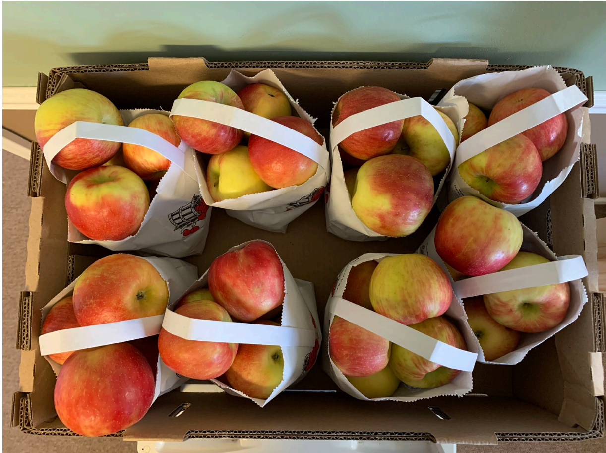
Sticker on bag indicates “Distributed by North Bay Produce, Inc. Traverse City, MI 49685”