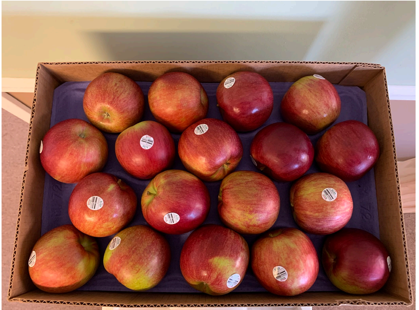
PLU#4019- Not Sold at Retail