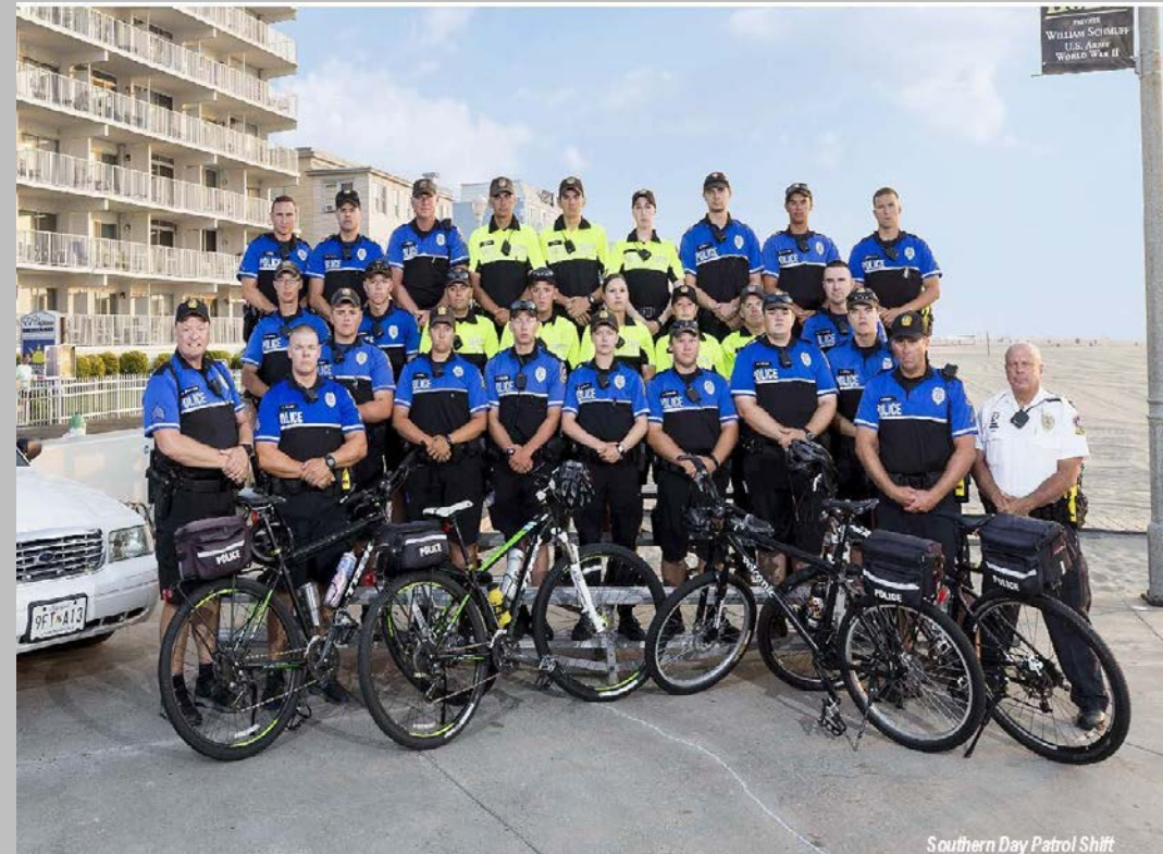
Southern Day Patrol Shift

**Applicant will be advised at the conclusion of the interview regarding status**