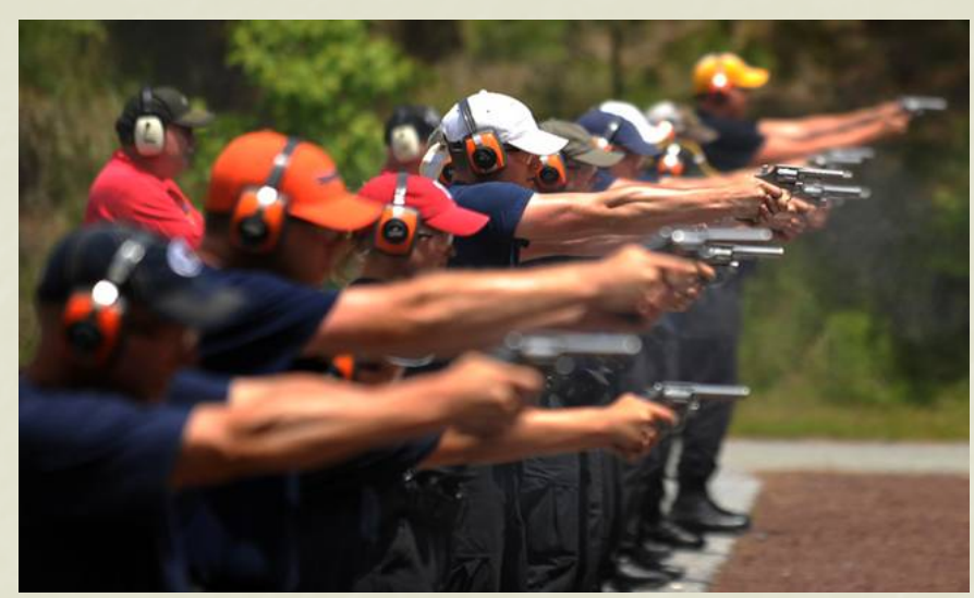
Seasonal Police Officer Training Academy