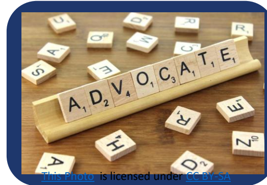
Research & Advocacy