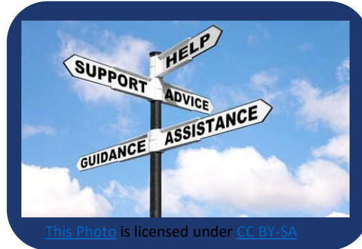
Financial Coaching & Education