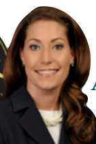
Alison Lundergan Grimes Kentucky Secretary of State