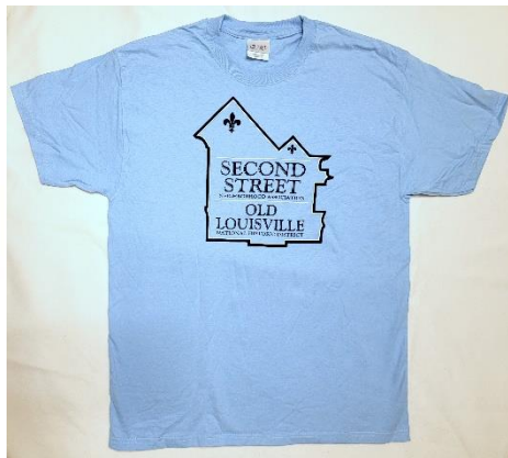
Official Second Street Work tee shirt, L, XL, or XXL