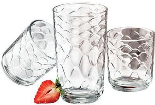
16 pc Glassware Set