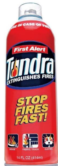
Home Fire Extinguisher

One of the lucky attendees at the next SSNA meeting will win their choice of door prizes shown above. Congratulations to Gary Hudson of 2 nd Street, winner of the 65-pc Screwdriver Ratcheting Set at the October 30 SSNA meeting!