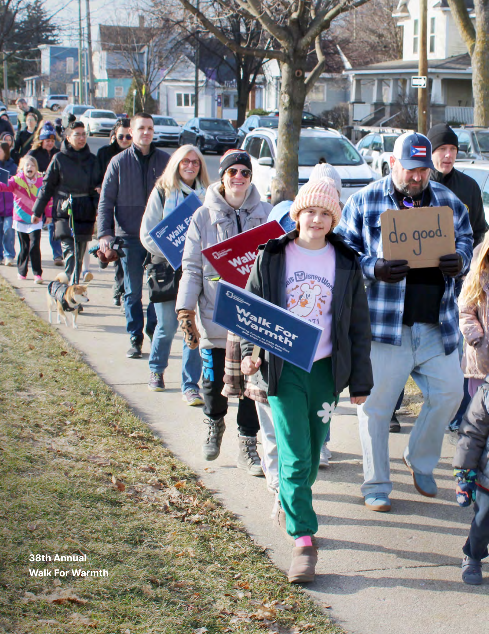
38th Annual Walk For Warmth