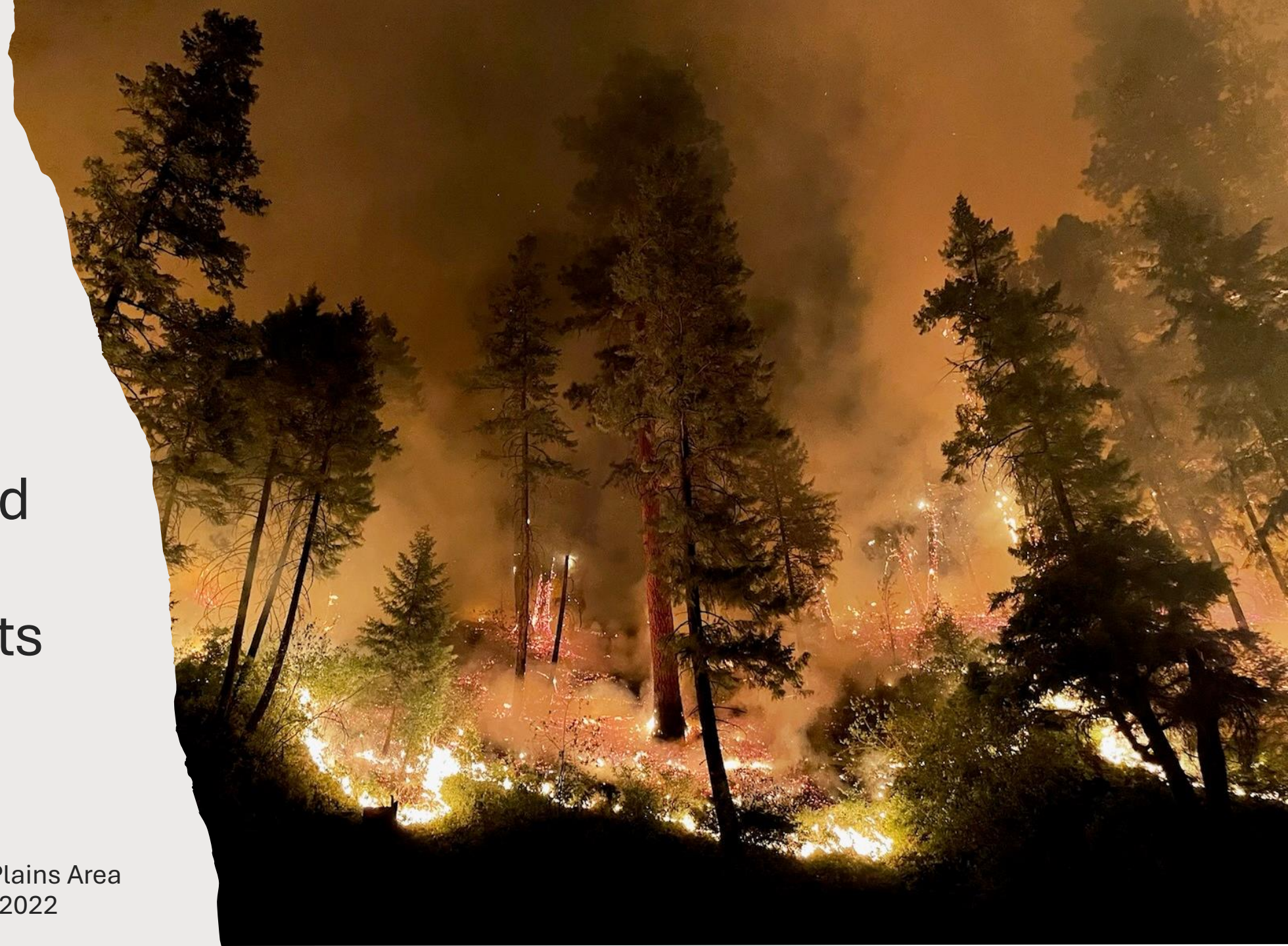
Photo: Quinn Fire – Joseph Plains Area in Idaho County, August 16, 2022