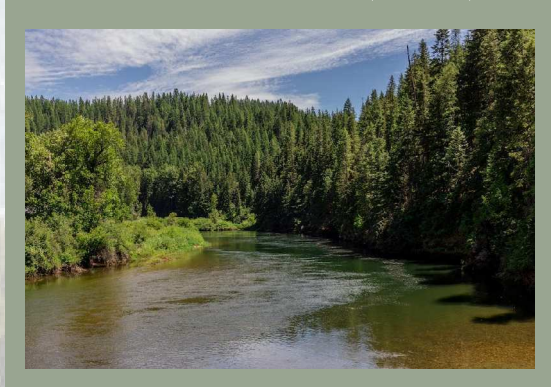
Promoting collaborative, science-based restoration on priority forest landscapes.

The Idaho Department of Lands is now accepting project proposals for the WSFM & LSR Grant Programs funded by the USDA Forest Service, State & Private Forestry Branch.