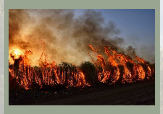
Funding wildfire risk mitigation efforts in the Wildland Urban Interface (WUI)