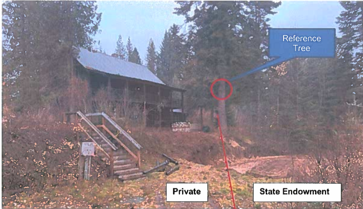
Inspection Photo, November 3, 2021

Note – Red line is for reference only, not official survey