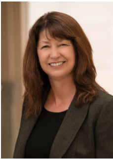
Betty Coppersmith Chair

Five-member citizen commission appointed by Governor and confirmed by the Senate