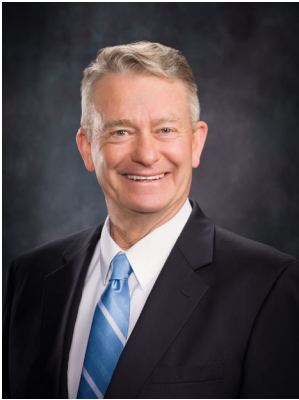
Governor Brad Little Chairman