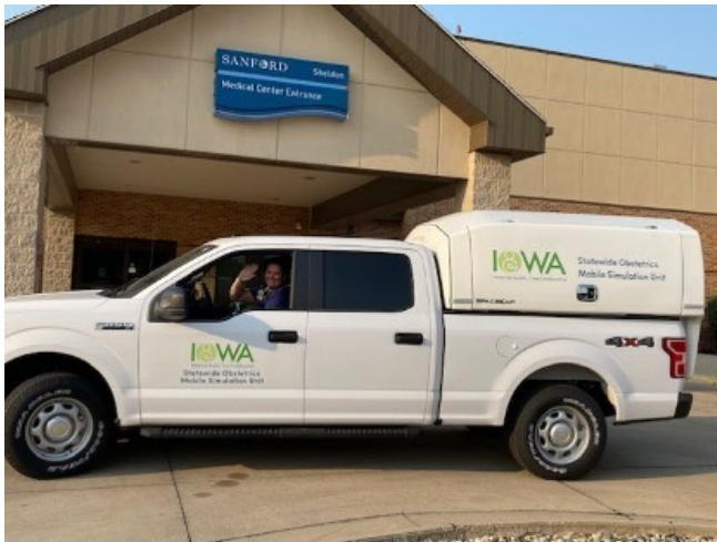
Stanford Medical Center in Sheldon, Iowa

The simulation team has been on the road visiting facilities in northwest Iowa and supporting simulation-based education for obstetrical emergencies!