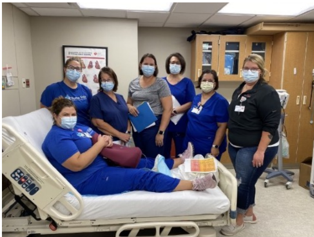
Buena Vista Regional Medical Center in Storm Lake, Iowa