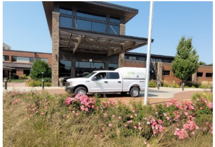
Lakes Regional Medical Center in Spirit Lake, Iowa