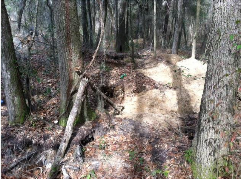
(Illegal dig site in Dougherty Co.)