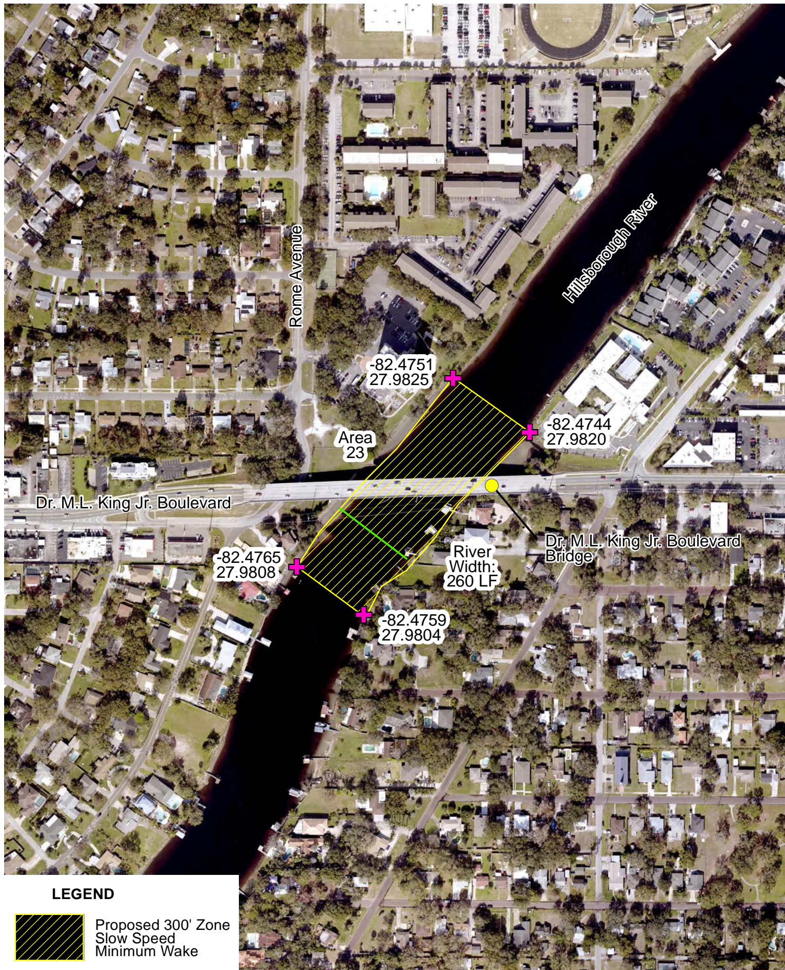
City of Tampa Exhibit HR-3 Proposed Boating Restricted Areas Dr. M.L. King Jr. Boulevard Bridge