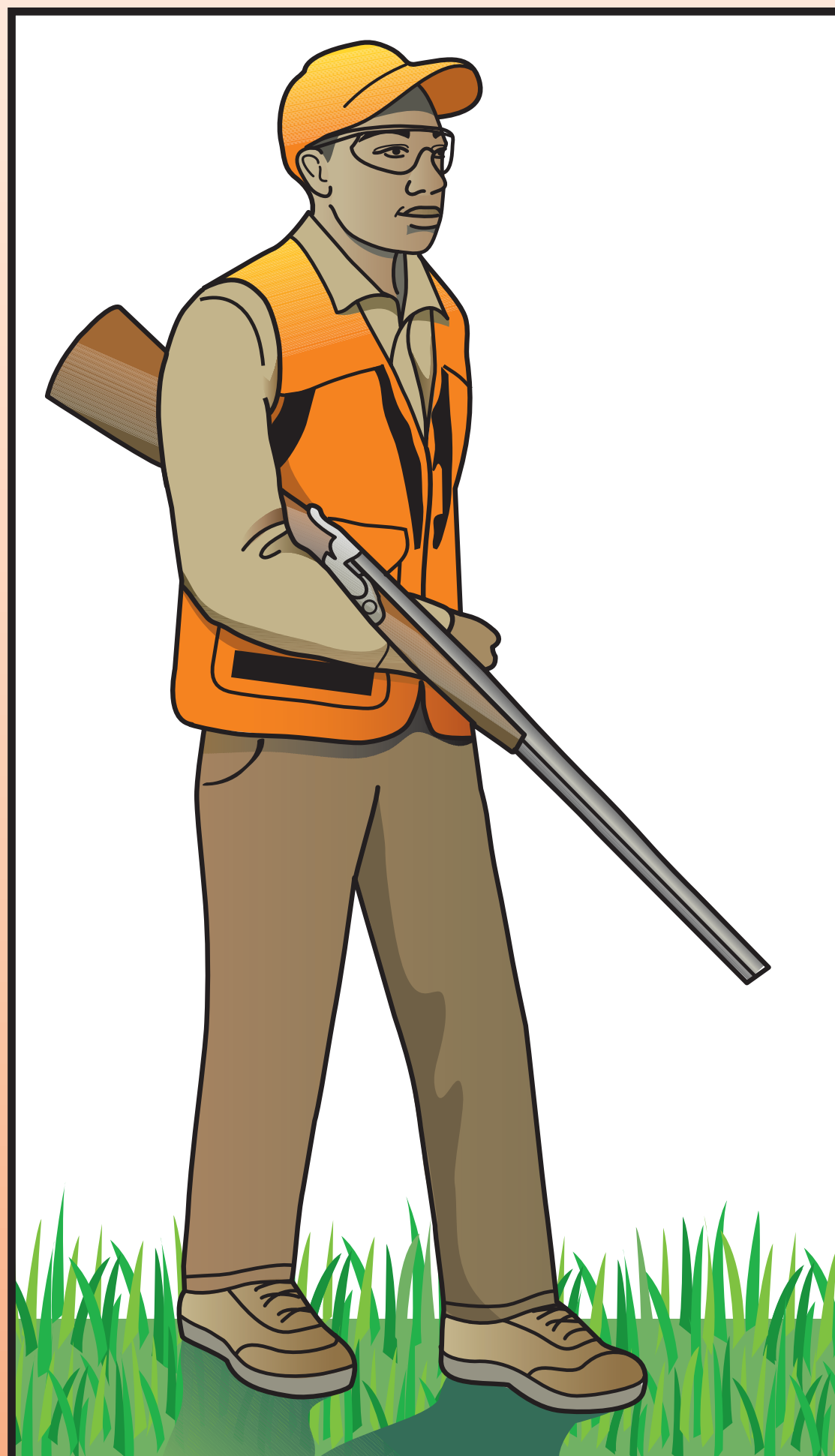
Elbow or Side Carry