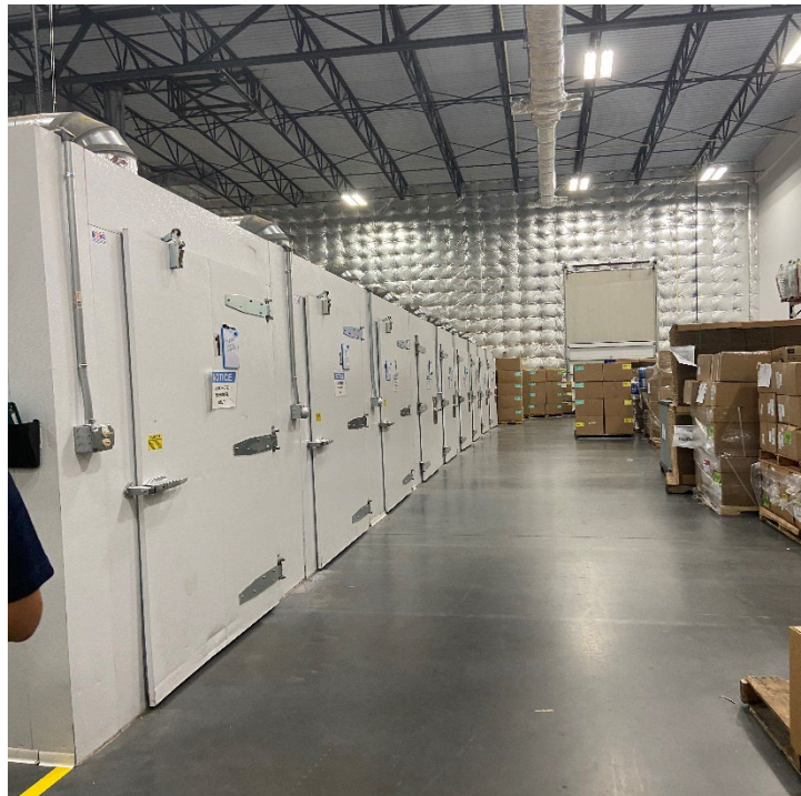
Aeration Chambers 1-9