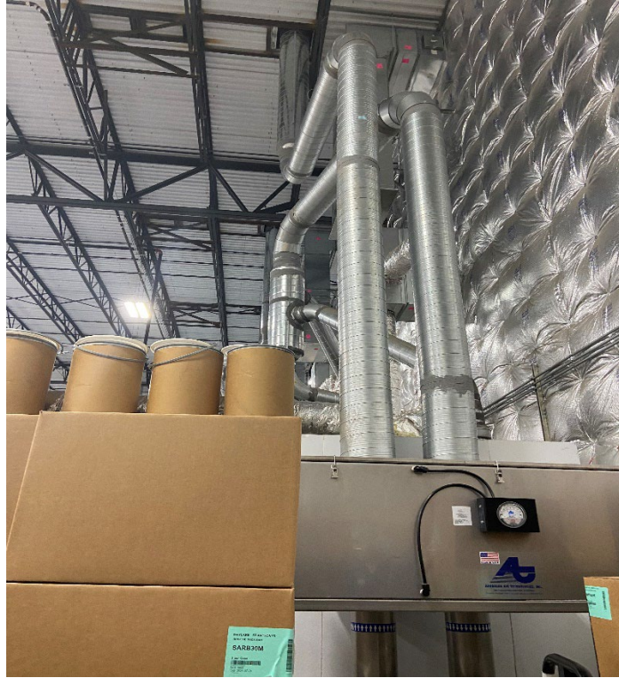
Dry Bed Scrubber with Intake, Exhaust, and Stack