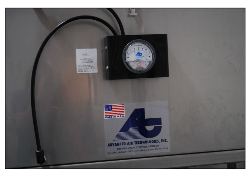
Scrubber 2 Panel