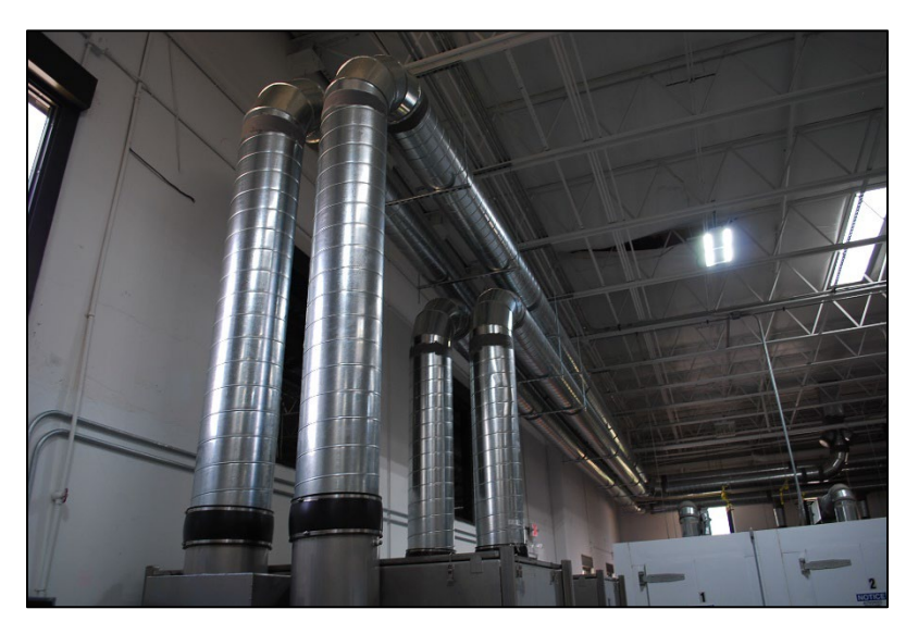
Scrubber Intake and Exhaust Pipes