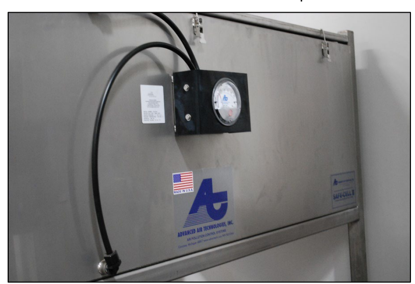
Scrubber 1 Panel