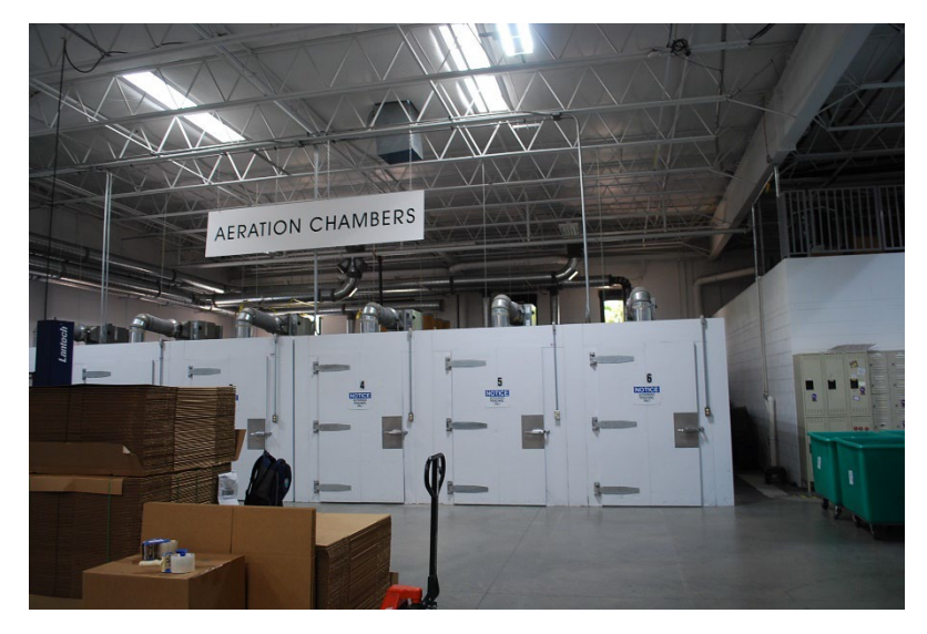
Aeration Chambers 4-6