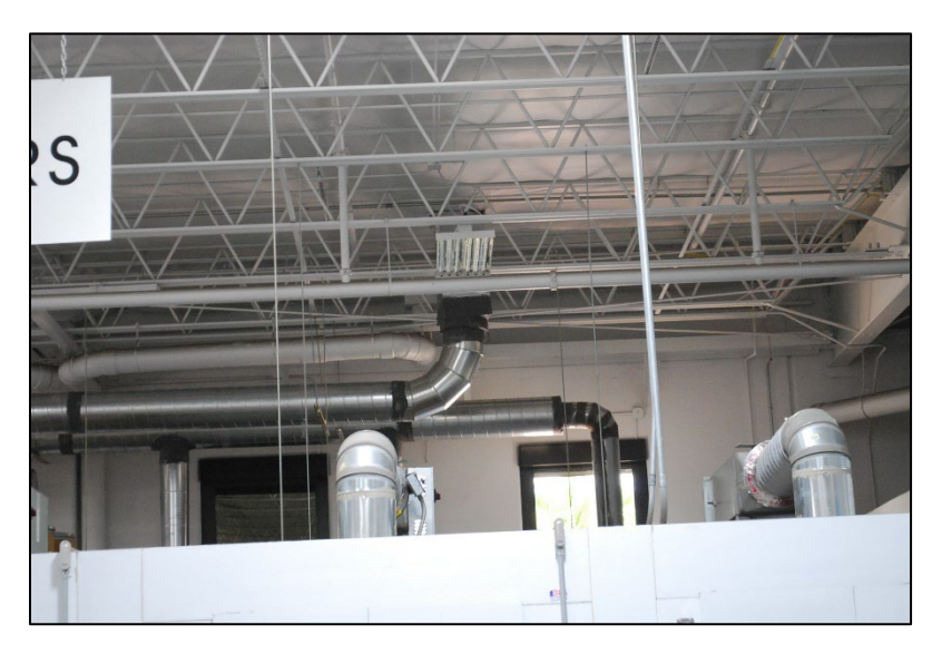
Stack from Scrubber 1