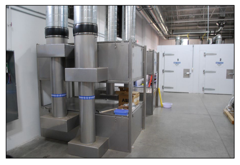
Dry Bed Scrubbers

As before the installation of the scrubbers, the facility is in compliance with the requirements of 62-210.310(5)(g) Florida Administrative Code.