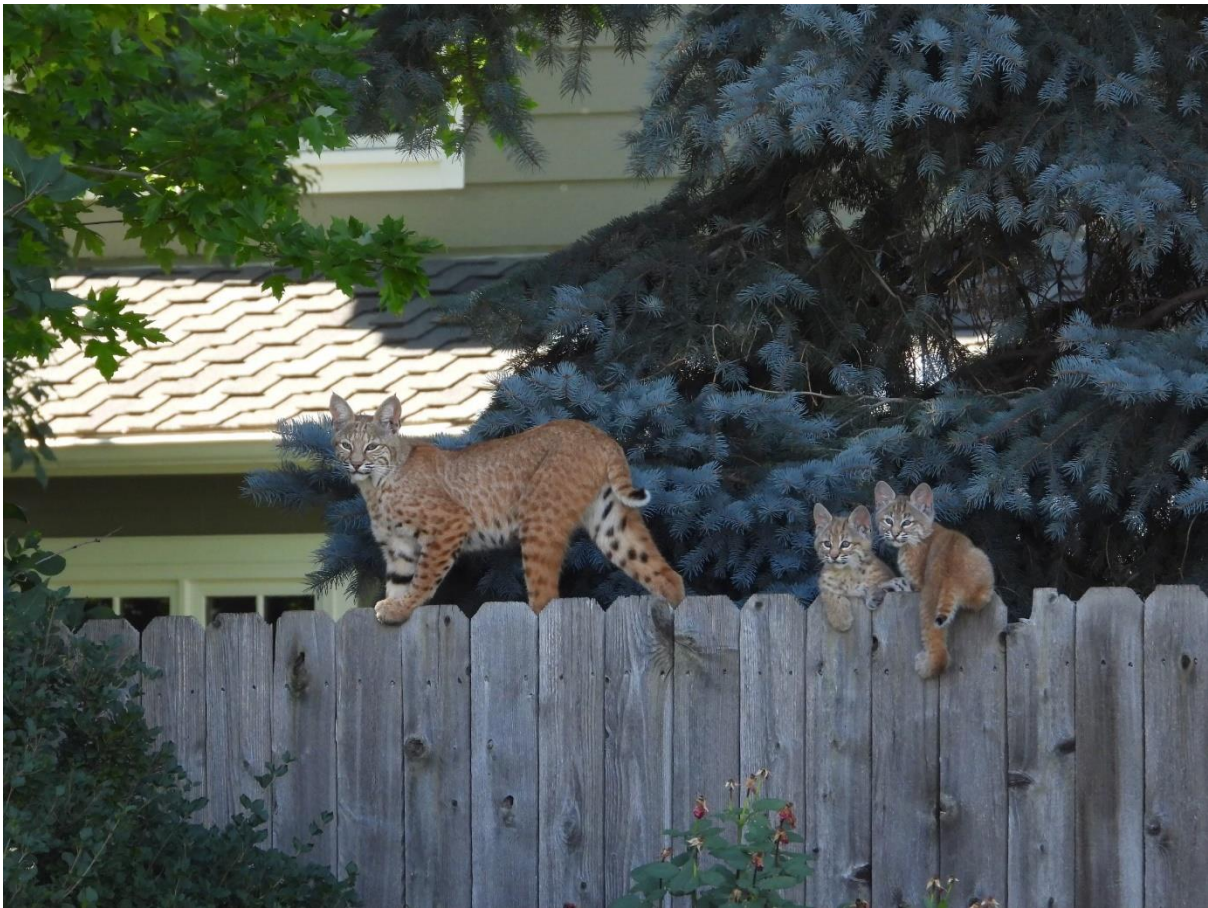
A bobcat and her two kittens observed in a Rock Creek neighborhood.

Sponsored by the Open Space Advisory Committee