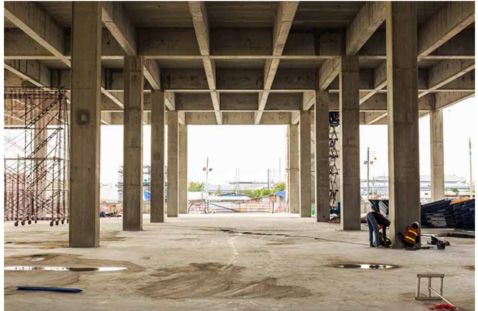
Moving certain key supply chain operations into the Port of Oakland itself should provide a number of benefits for port productivity.

For example, Oakland is preparing a request for proposals to develop a 4 to 6 acre site into a station where trucks will be fueled and weighed and drivers will have access to food and other services. Moving these activities inside the port gates is not only more convenient for truckers, but enhances the port authority’s objective of being a good corporate