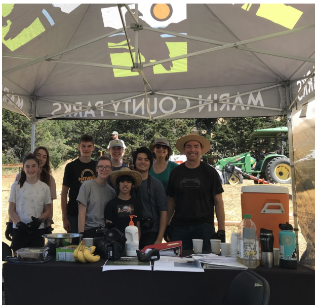
Volunteers joined Marin County Parks and Open Space staff in providing signage and fencing at the Poor Farm Burial Grounds