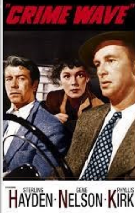
Crime Wave Film noir classic filmed in Glendale (Warner Bros. 1954)