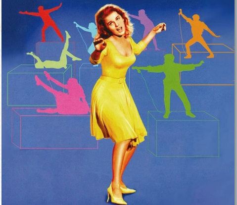
Bye Bye Birdie Janet Leigh Dick Van Dyke Ann-Margret (Columbia 1963)

Bring your picnic, blankets and chairs! Admission is free!