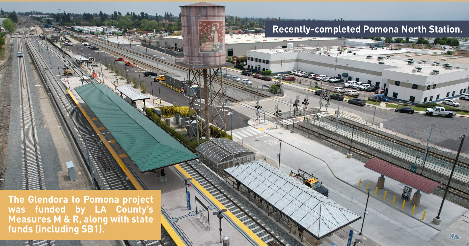
Recently-completed Pomona North Station.

The Glendora to Pomona project was funded by LA County's Measures M & R, along with state funds (including SB1).