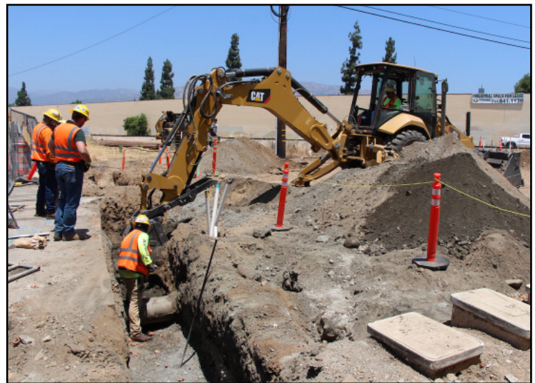
SoCal Gas subcontractor performing underground utility removal and relocation at Gladstone St. railroad crossing

Through the effort of the team of engineers from KPJV, the Construction Authority, the corridor cities and numerous other agencies, design is now more than halfway complete, and major construction is now underway.