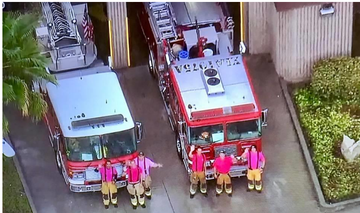
On October 28 th , Firefighters from Fire Station 2 were photographed on Good Day LA’s Firehouse Friday with Rick Dickert.