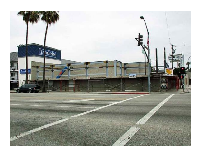
13463 Washington Boulevard, Costco remodel and addition: