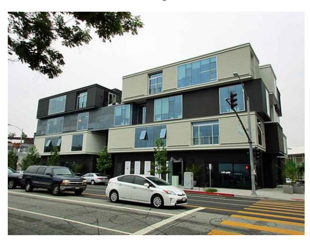
This is the west building, the new parking structure:

This is the middle building, a new office building: