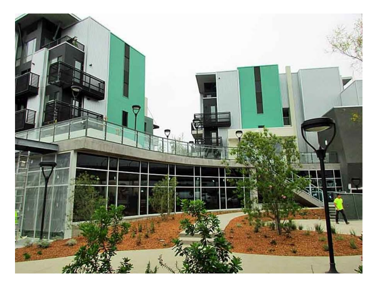
The northeast corner on Washington Boulevard:

The ground level corner courtyard at the intersection of Washington and National Boulevards: