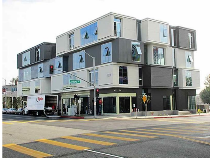
The Platform project, Washington Boulevard, the middle building, new 4 story office building