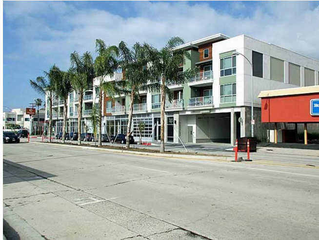
11957 Washington Boulevard, the "Marcasel" mixed use project is complete; street median trees have been planted