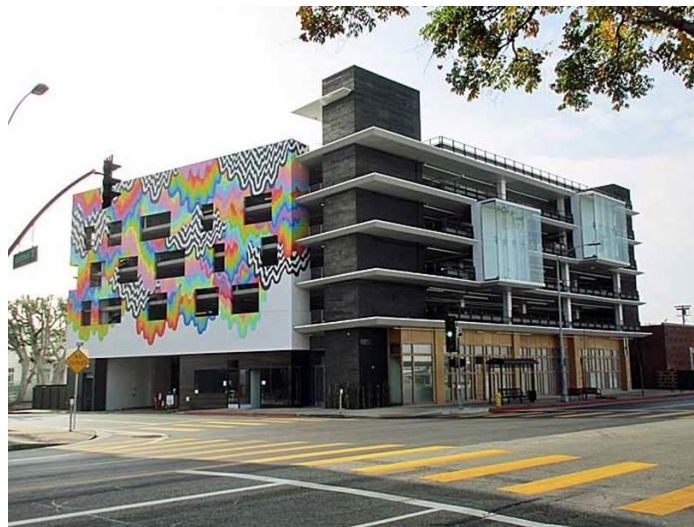
The Platform project, Washington Boulevard, the west building, new parking structure