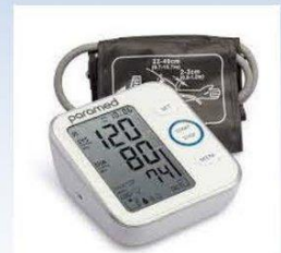
High Blood Pressure