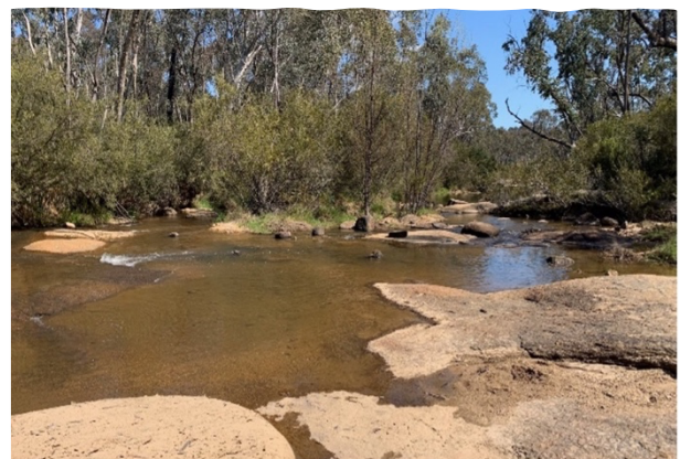
Figure – Reedy Creek (Chiltern-Mount Pilot National Park)

Parks Victoria will continue to update to the community on this project to improve access to Reedy Creek. For further enquiries on about this work, please contact info@parks.vic.gov.au or 13 19 63.