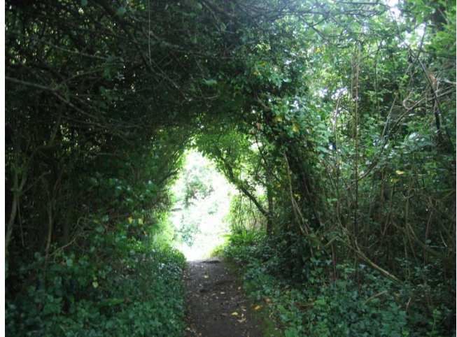
Above: The Undercliff in East Devon.