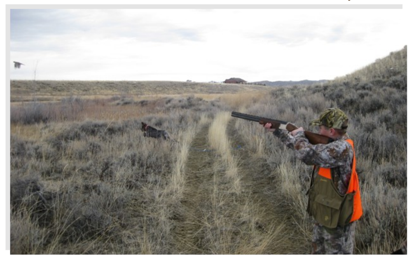
A young hunter participating in a youth pheasant hunt last month hosted by the Northwest Chapter of the Wild Turkey Federation, Bighorn Basin Chapter of Pheasants Forever, and Triple KB Ranch and bird farm.

North Cody Game Warden Travis Crane and Powell Game Warden Chris Queen participated in a youth hunting event near Cody in February. Over 50 young hunters participated in the event that was put on by the Northwest Chapter of the Wild Turkey Federation, Bighorn Basin Chapter of Pheasants Forever, and Triple KB Ranch and Bird Farm out of Cody. The day started off with shooting trap at the Cody Shooting Complex to improve their shooting skills and later that afternoon, youth participated in a pheasant hunt. Each participant was allowed to hunt with a mentor, behind a trained bird dog, and allowed to harvest two pheasants. The Wyoming Game Wardens Association purchased game bird licenses for those who did not already have one. The event provided many young hunters their first opportunity to participate in a pheasant hunt.