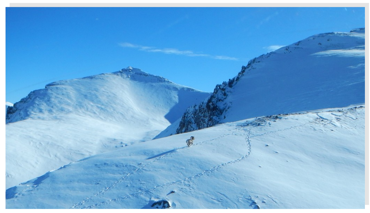
A ram climbs the north slope of Thorofare Mountain on 2/23/2015. This is near the point where the Thorofare and the North and South Forks of the Yellowstone River originate.

Wildlife Biologist Doug McWhirter and Wildlife Management Coordinator Tim Woolley conducted an aerial classification survey of bighorn sheep in Hunt Area 4 in late February. A total of 327 sheep were classified in the Cody Region portion of Hunt Area 4 (South Fork Shoshone, Thorofare, Upper Yellowstone), and lamb:ewe and ram:ewe ratios were 35:100 and 43:100, respectively. This is in addition to Hunt Area 4 sur-