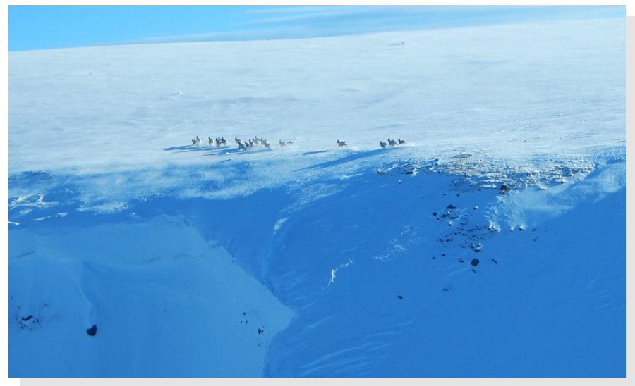
A group of bighorns on winter range near Wall Mountain in the Upper South Fork Shoshone River. This is what bighorn sheep winter range looks like at over 11,000 feet.

These figures represent a return to sample sizes obtained in the Cody Region from the mid-1990s to a population decline initiated by the spring of 2011. Sample sizes in the Lander Region remain 40 percent lower than that seen from the mid-1990s to 2011. Ram:ewe ratios remain at acceptable levels and the lamb:ewe ratios seen on these surveys were among the best of all sheep herds sampled postseason 2014.