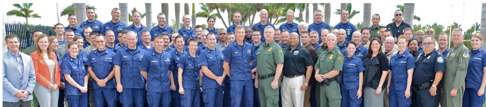
Homeland Security Task Force Southeast concludes Integrated Advance 2015.

Every other year, DHS takes part in a massive interagency exercise focused on coordinating efforts in response to a major humanitarian crisis and mass migration in the Caribbean. This year's exercise, Integrated Advance 2015, was led by the U.S. Southern Command in coordination with DHS. Numerous DHS agencies took part, including FEMA, the U.S. Coast Guard, Customs and Border Patrol and more, as well as every branch of the military, the Departments of State and Health and Human Services, state of Florida agencies, and private sector, non-governmental organizations.