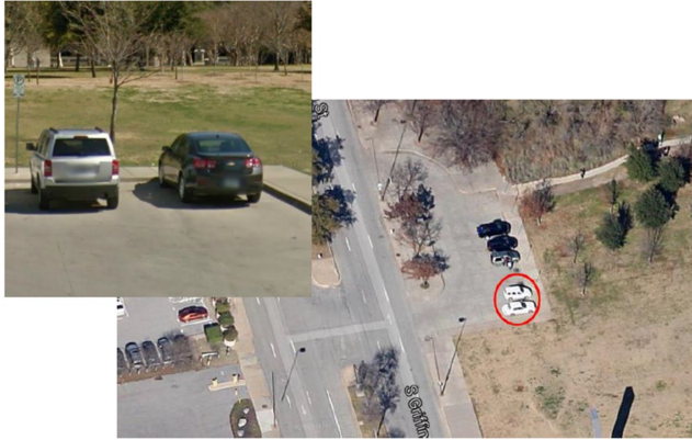
OAK LAWN LIBRARY