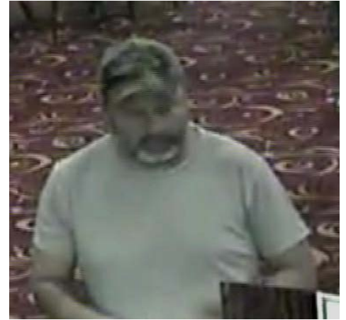
August 5, 2014 Photo