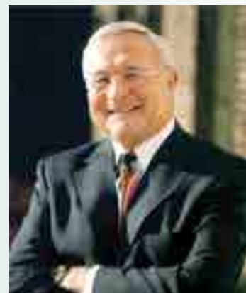
Leader and Founder of the Medical Main Street Initiative