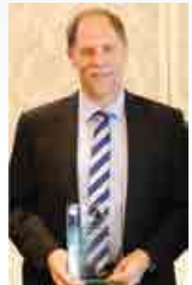
2012 Award Winners

Sentio LLC (pictured) Southfield, Michigan