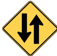
Two Way Trail