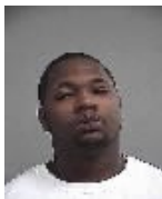
Brown B/M 01/05/1991