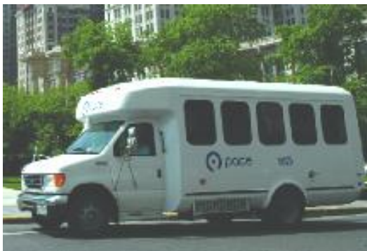
WHEN RIDING PARATRANSIT FIRST

Upon boarding the ADA or Dial-a-Ride bus, tell the driver you will be transferring to a Fixed Route. You pay the Paratransit fare and the applicable transfer fare. The Paratransit driver issues 2 Transfer Vouchers. You use the first Transfer Voucher to board the Fixed Route bus. You use the second Transfer Voucher when boarding the Paratransit bus on your return trip.