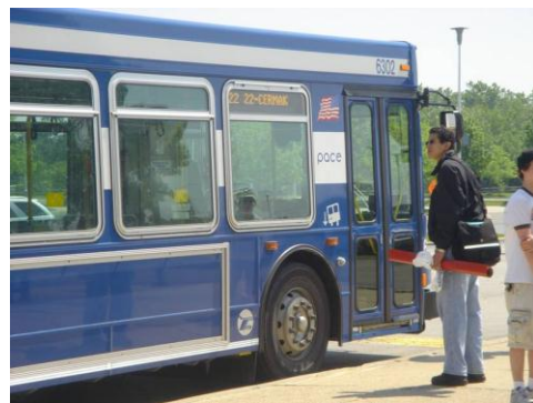
TRANSFERRING TO FIXED ROUTE

Pay the $3.00 ADA fare or the Dial-a-Ride fare and applicable transfer fare. The Paratransit driver will fill out and hand you 2 Transfer Vouchers .