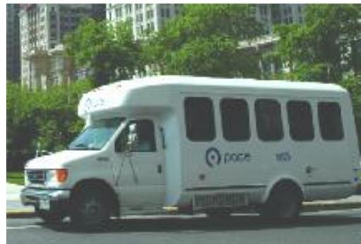
TRANSFERRING TO PARATRANSIT

Pay the $3.00 ADA or applicable Dial-a-Ride fare.