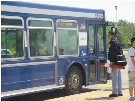
WHEN RIDING FIXED ROUTE FIRST ...THEN...

You will pay the appropriate fare on both the Fixed Route bus and the ADA or Dial-a-Ride bus. The Fixed Route drivers are not able to provide Transfer Vouchers. When you board the Fixed Route bus you will pay your fixed route fare using Ventra or cash. When you board the Paratransit bus you will pay the appropriate fare for ADA or the Dial-a-Ride service.