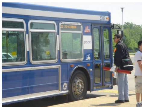
WHEN RIDING FIXED ROUTE

You pay the appropriate fixed route fare using Ventra or cash. (The transfer fee does not apply.) When boarding the Paratransit bus, present the second Transfer Voucher to the Paratransit driver.